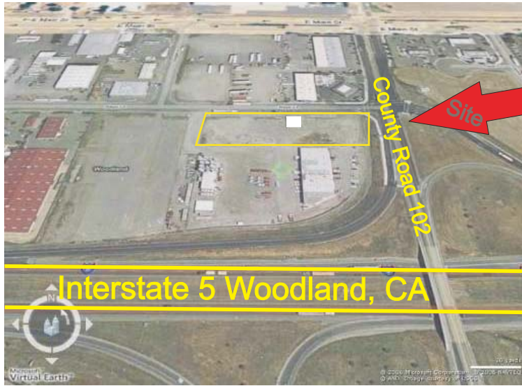
Hayes Lane at County Road 102