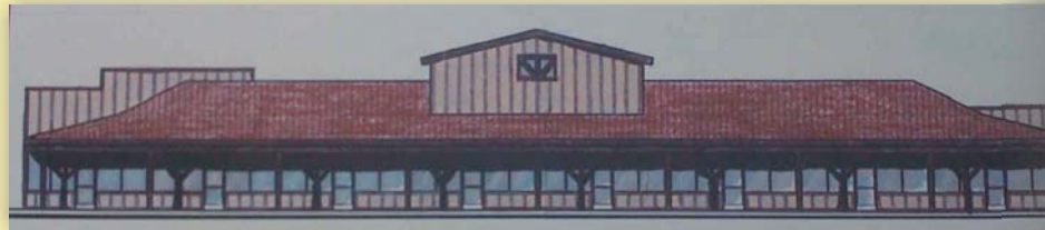
Elevation of Phase II Building